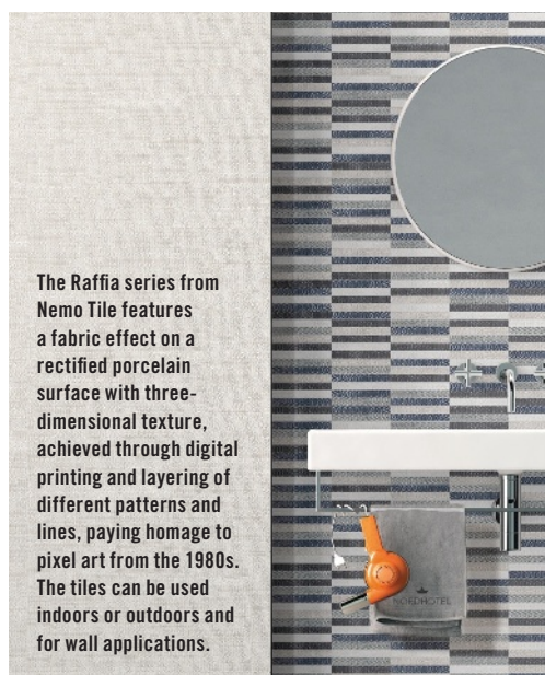
The Raffia series from Nemo Tile features a fabric effect on a rectified porcelain surface with three-dimensional texture, achieved through digital printing and layering of different patterns and lines, paying homage to pixel art from the 1980s. The tiles can be used indoors or outdoors and for wall applications.

Barn doors give the bath entryway a different look.