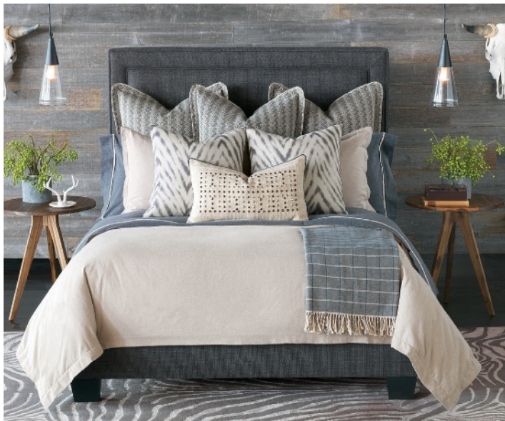
The Barclay Butera Landon Collection is inspired by the mountain vistas in Park City, UT. The duvet and shams are 100% brushed cotton, designed for a cashmere-like feel that is machine washable.

Use a platform with a mattress for an updated look.