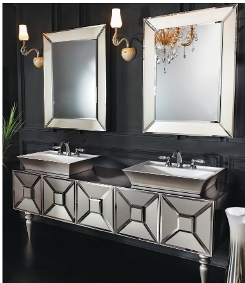
Topex Design's Fiaba vanity series features glass finish cabinets with matching solid glass countertops. The vanities are made of solid aluminum, are completely waterproof and come in four sizes. Colors include black, burgundy, delmar silver and white.