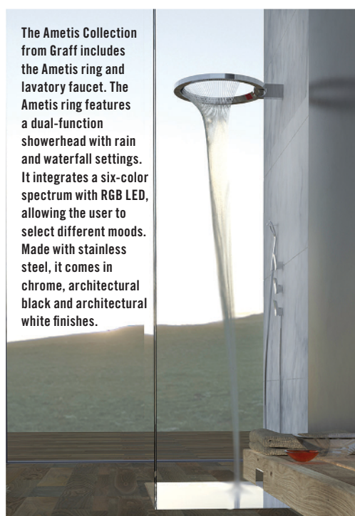
The Ametis Collection from Graff includes the Ametis ring and lavatory faucet. The Ametis ring features a dual-function showerhead with rain and waterfall settings. It integrates a six-color spectrum with RGB LED, allowing the user to select different moods. Made with stainless steel, it comes in chrome, architectural black and architectural white finishes.